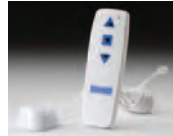
For optional remote control operation, see options on pages 50-54.