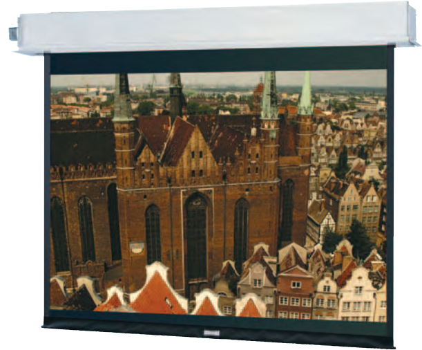
Matte White fabric up to 10' high will be seamless. High Contrast Matte White and Video Spectra 1.5 fabrics up to 8' high will be seamless. High Power® fabric up to 6' high will be seamless.