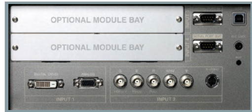
Ready to connect and project. Add Network, SDI, more!